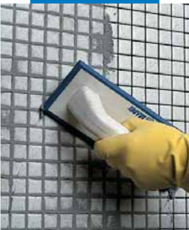
Grouting a glass mosaic (bathroom) with a float