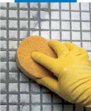
Finishing a glass mosaic with a sponge