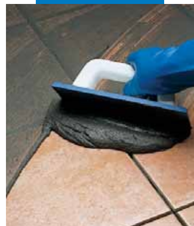
Grouting single-fired tiles with a float