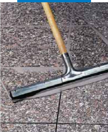
Grouting of pre-smoothed and glossed granite floor with rubber float