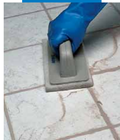
Finishing with a Scotch-Brite® pad