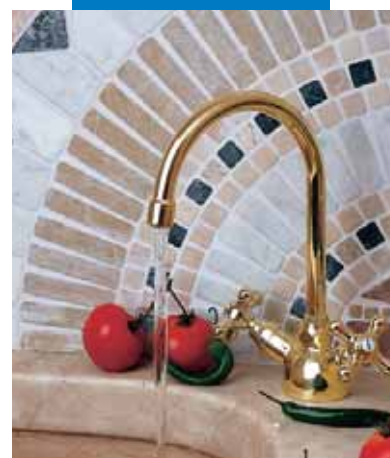
An example of a grouted mosaic tile kitchen